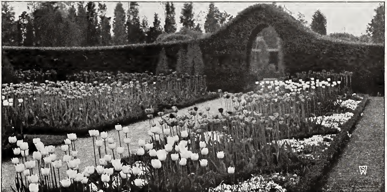
A well-designed and pleasing display of Darwin Tulips

Superb Prize Mixture. The wonderful interest in these splendid Tulips has brought out a great many varieties too numerous for listing, except those considered the best. In addition to some of the varieties listed above, our mixture contains an equal proportion of many others. Brilliant effects may be obtained by the planting of this mixture of choice named sorts. 60 cts. per doz., $4 per 100, $35 per 1,000.